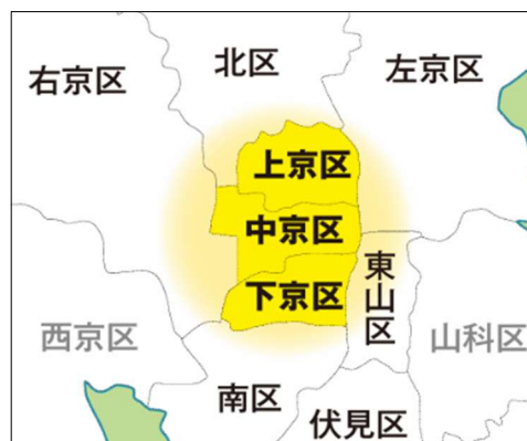
<Delivery Area Image>

By zip code on the FRESCO Net Super website. You can check by zip code on the website.